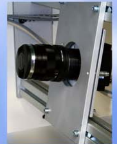
Flytec Camera System