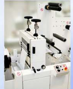
Die Cutting Unit