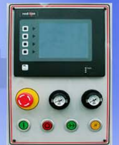
New HMI Touch Screen