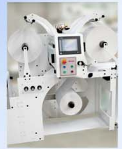
Twin Rewind Version