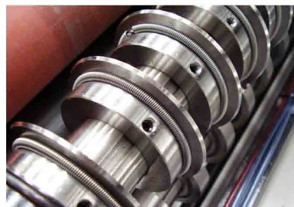
Rotary Scissor Slitting