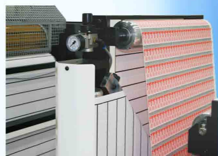
Air Assisted Web Turn Bar