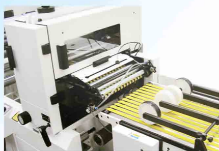
Rotary Sheeting/Through Cutting Unit