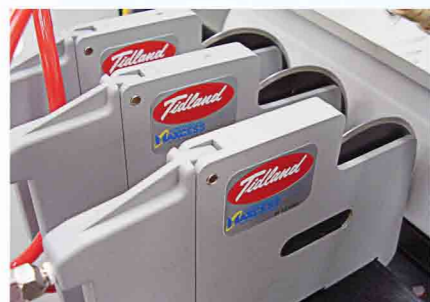
Crush Cut Slitting