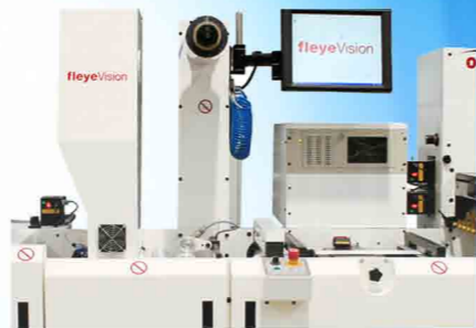
100% Camera Inspection Systems