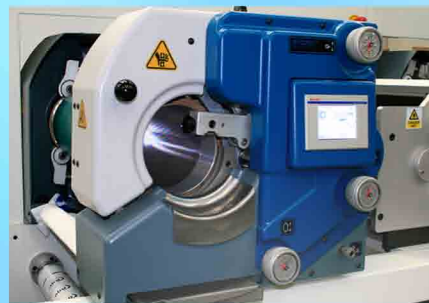
Full Rotary Screen Head (Stork)